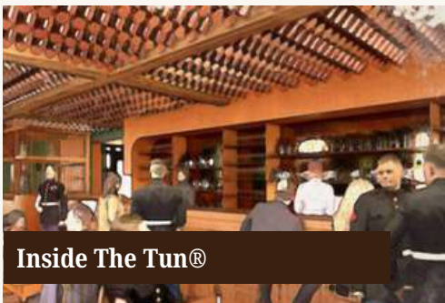
Inside The Tun®