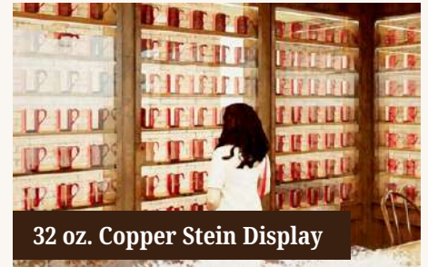
32 oz. Copper Stein Display