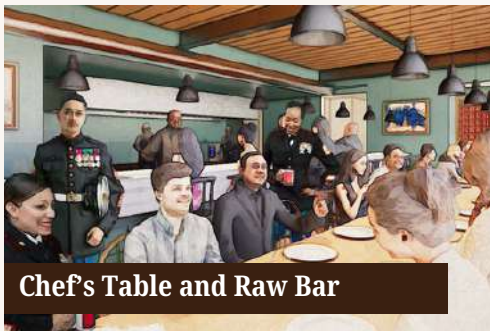
Chef's Table and Raw Bar

Additional Benefits include publicity opportunities, exclusive event access and a lasting charitable legacy tied to veteran and Masonic initiatives.