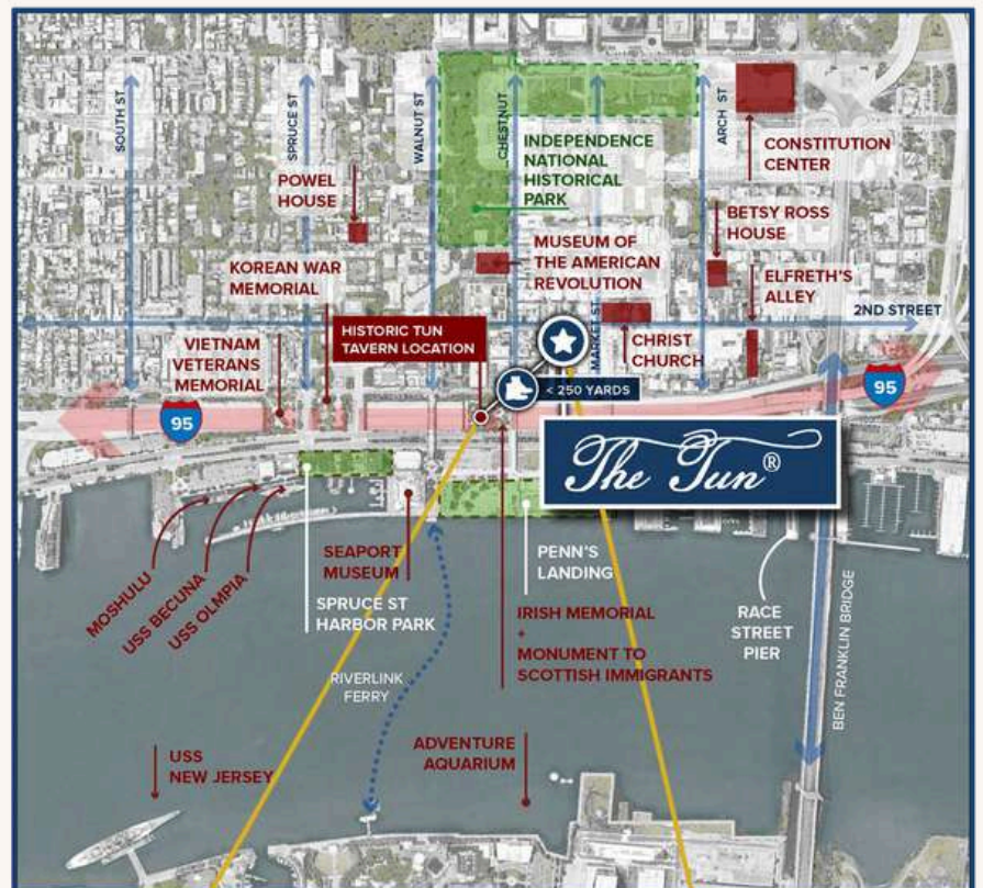
Historic Tun Landmark

Situated alongside many of Philadelphia's historic landmarks, the site is an ideal location for students, military veterans and community members to learn and engage with the city's rich heritage.