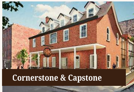
Cornerstone & Capstone