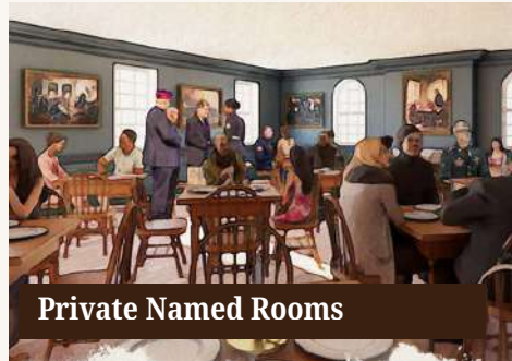
Private Named Rooms